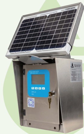
EMFLUXI500 Flowmeter Transmitter